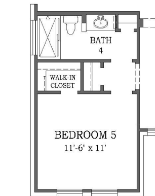
Opt. Bedroom 5/ Bath 4