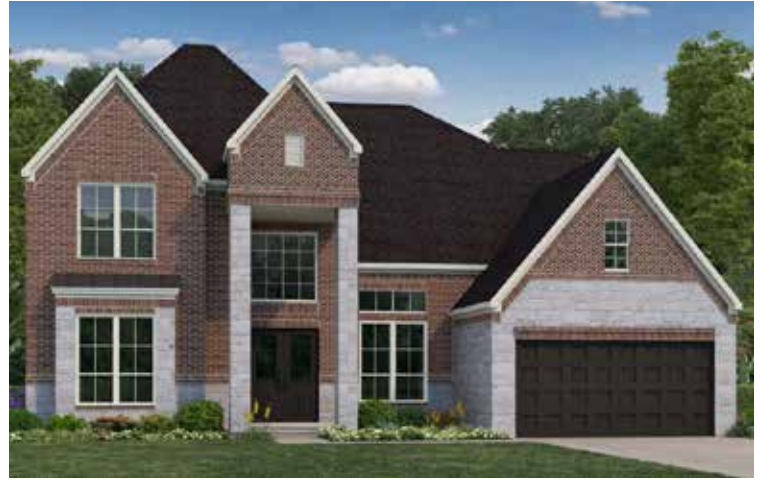
THE COMAL II | 17568 WATERCOLOR WAY Was $841,785 Now $719,990 | 4,303 sq. ft. 4 Bed | 4.5 Bath | 3 Car Garage | 2 Story