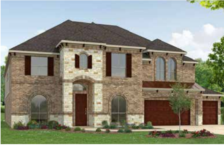
THE AUBURN | 17584 WATERCOLOR WAY Was $821,148 Now $709,990 | 4,435 sq. ft. 6 Bed | 4 Bath | 3 Car Garage | 2 Story