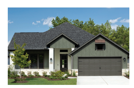
THE SAGE 17331 SUNFLOWER PETALS TRAIL 17311 SUNFLOWER PETALS TRAIL

Was $613,381 Now $559,990 2,445 sq. ft. 3 Bed | 2/0 Bath 2 Car Garage | 1 Story