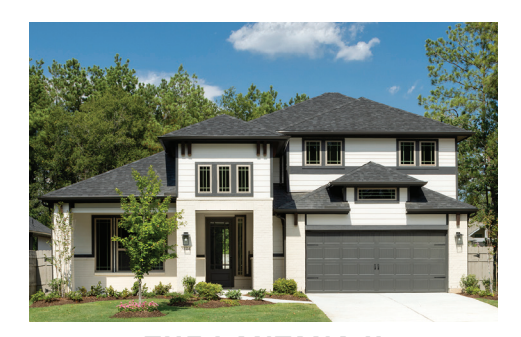
THE LANTANA II 17335 SUNFLOWER PETALS TRAIL 17339 SUNFLOWER PETALS TRAIL 17319 SUNFLOWER PETALS TRAIL

Was $693,856 Now $649,990 3,188 sq. ft. 5 Bed | 4/1 Bath 3 Car Garage | 2 Story