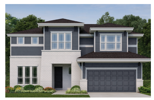
THE AGAVE 17242 BLOOMING SUZANS LANE

Was $583,426 Now $529,990 2,178 sq. ft. 3 Bed | 2/1 Bath 2 Car Garage | 1 Story