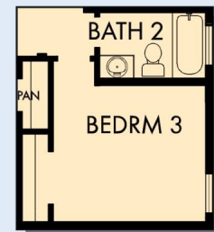
OPTIONAL BEDROOM 3 AT STUDY