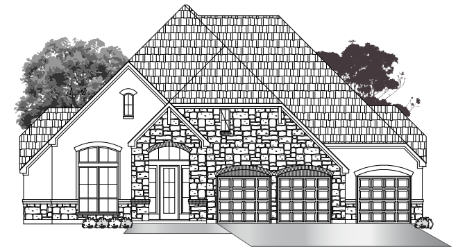
• ELEVATION D2 •