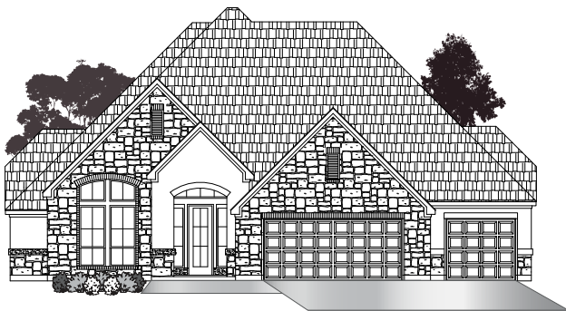
• ELEVATION D1 •