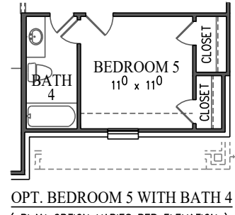
( PLAN OPTION VARIES PER ELEVATION )